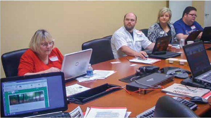
Business owners attending the Hamilton Website Design workshop share ideas for pictures and content that should be included on a business website.