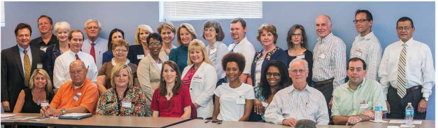
Group attendees at AERN's Annual Meeting at the Edge.