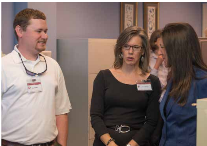
Attendees at annual meeting at the Edge.