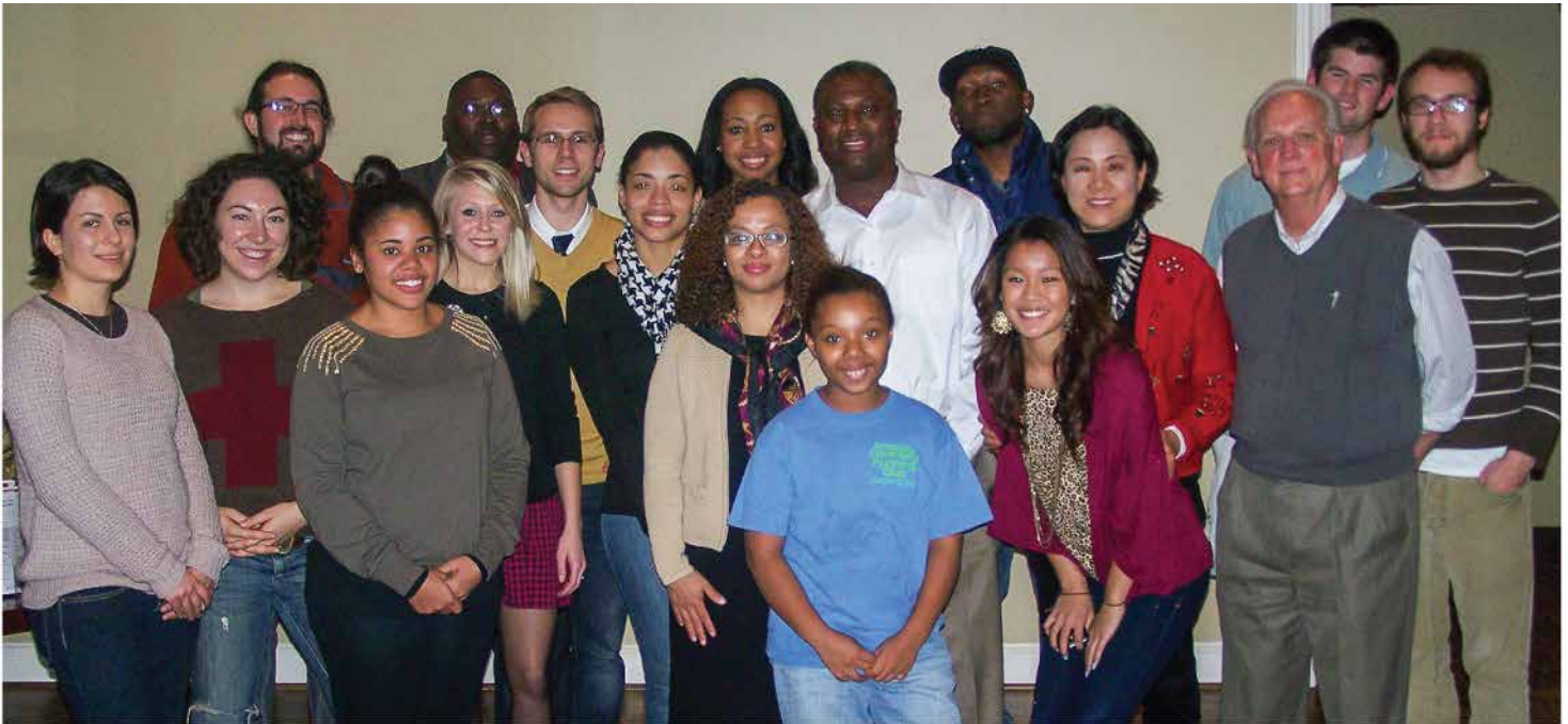
This group photo contains a few of the many CCBP students who have been a part of the news team that has publicized the activities of the Division of Community Affairs over the past eight years. You will also recognize some of the permanent staff, who have served as the mentors of these budding media professionals.