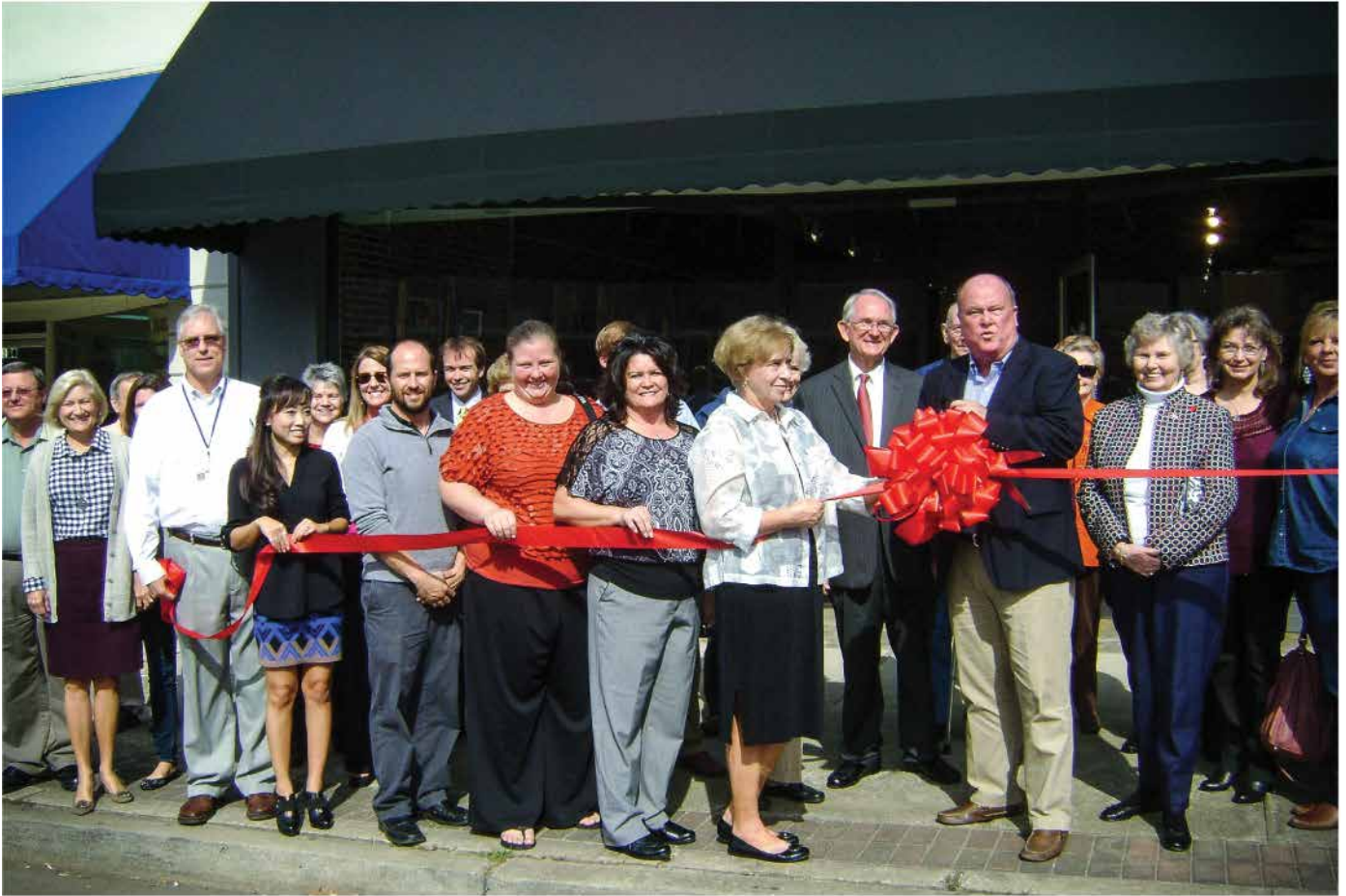
AERN attends the ribbon cutting of the High Horse Gallery in Greenville on October 29.