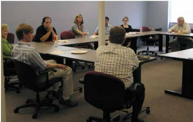
AERN participates in a mentoring session for student-owned businesses at the Edge.